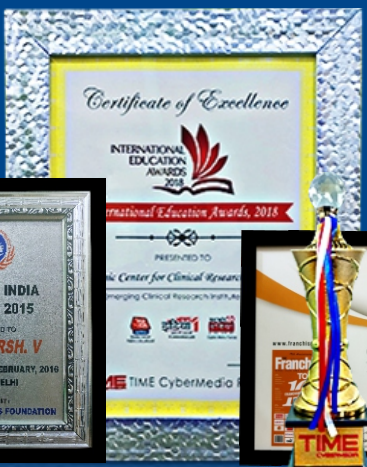
Top 100 Franchise Opportunities for the Year 2017