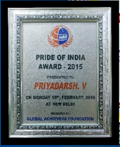
Pride of India Award 2015