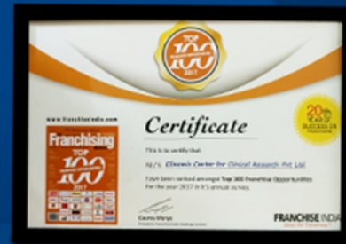
Top 100 Franchise Opportunities for the Year 2017