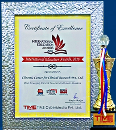
International Education Award 2018 for Most Emerging Clinical Research Institute in Mumbai