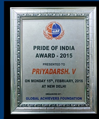
Pride of India Award 2015